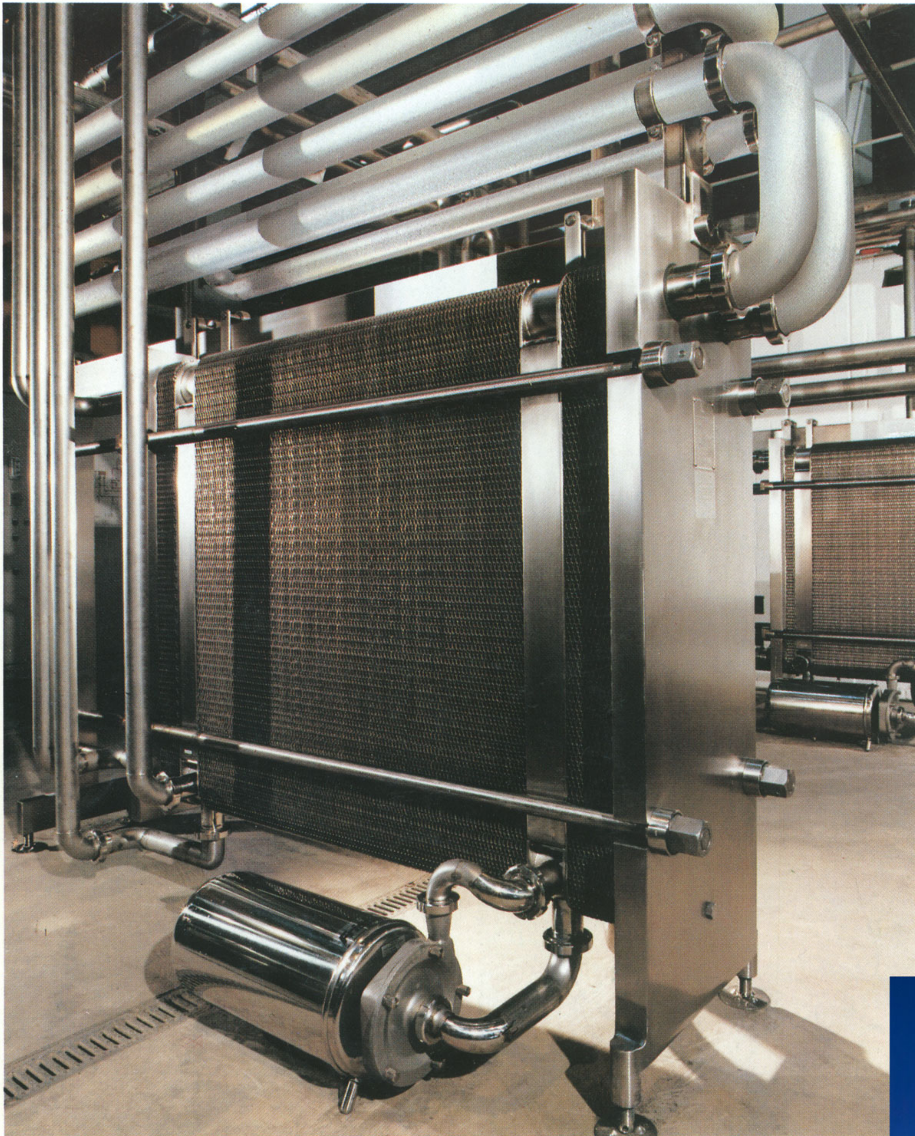
FREE FLOW N 40 Fruit juices pasteuriser